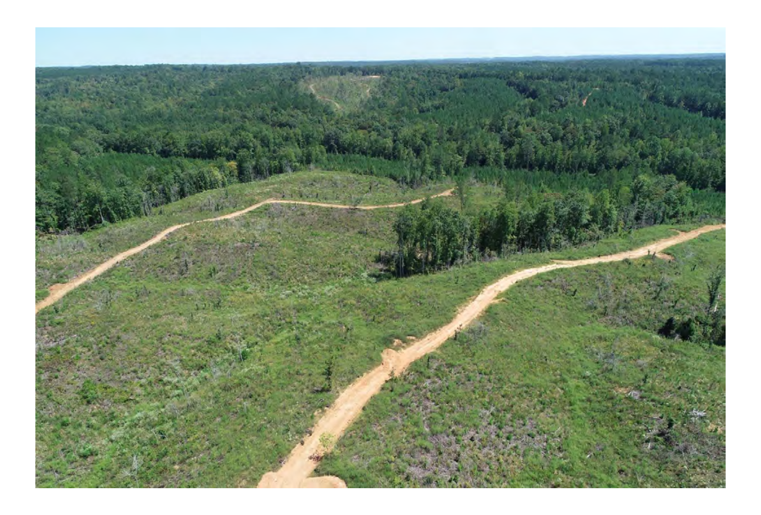
Tallapoosa County - +/- 311 Acres: Josie Leg Creek Tract